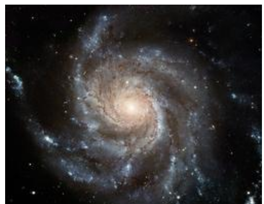
Spiral galaxy: Hubble Space Telescope.

http://ncronline.org/blogs/spiritual-reflections/psalm-cosmic-communion