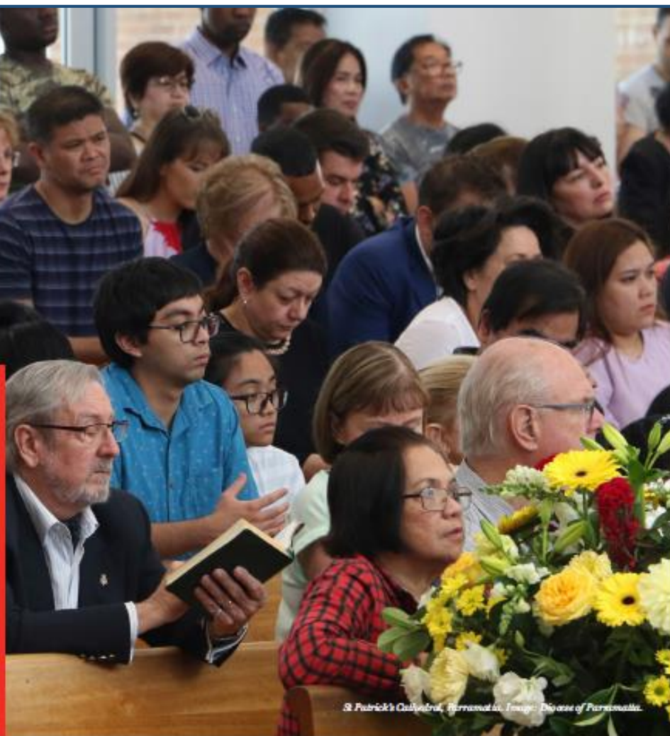
S. Patrick's Cathedral, Parramatta, NSW: Diocese of Parramatta.