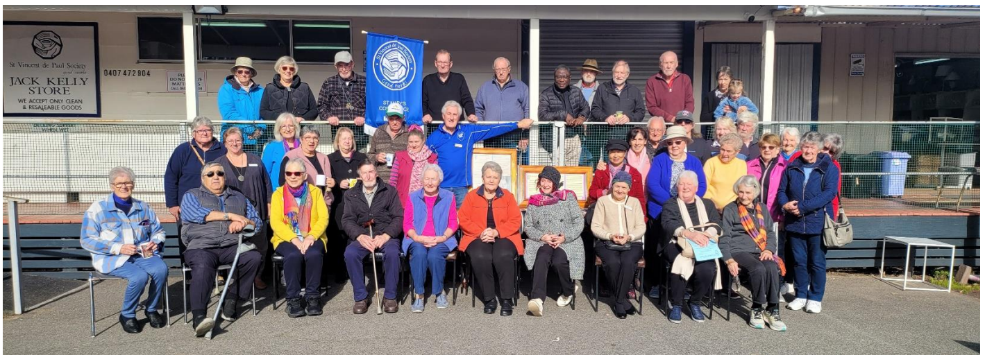
Members and Volunteers of the St Vincent's De Paul Conference Maffra.