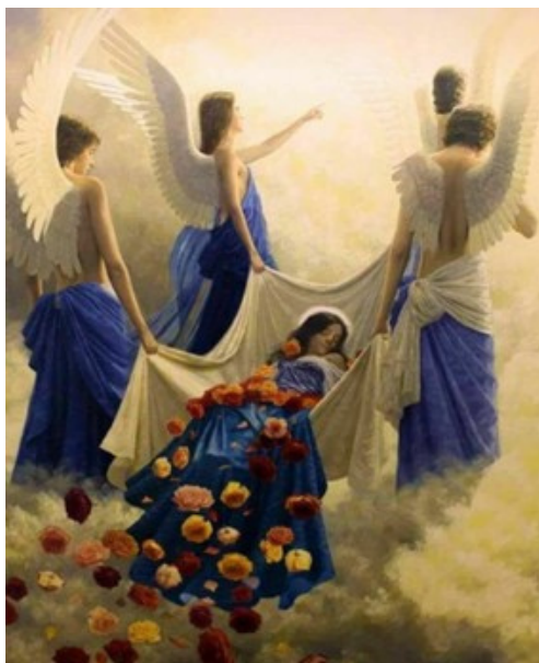
The Assumption or The Dormition, a fresco by Juan de Jesus Munera Ochoa in the Cathedral of San Pedro de los Milagros (Saint Peter of the Miracles) in Antioquia, Colombia.

“I shall return to take you with Me.” Jn. 14:3