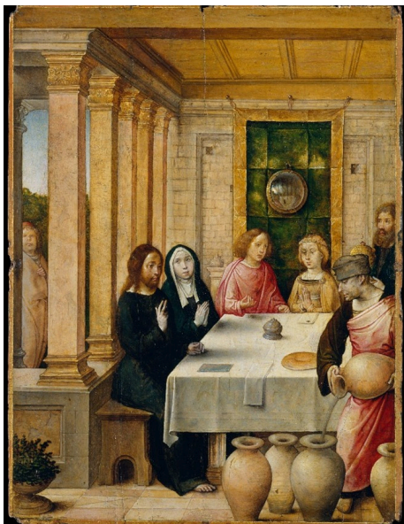
John of Flanders: c. 1460- c. 1519

On the third day there was a wedding in Cana of Galilee, and the mother of Jesus was there. Jesus and his disciples had also been invited to the wedding. When the wine gave out, the mother of Jesus said to him, "They have no wine." And Jesus said to her, "Woman, what concern is that to me and to you? My hour has not yet come." His mother said to the servants, "Do whatever he tells you." Now standing there were six stone water jars for the Jewish rites of purification, each holding twenty or thirty gallons.