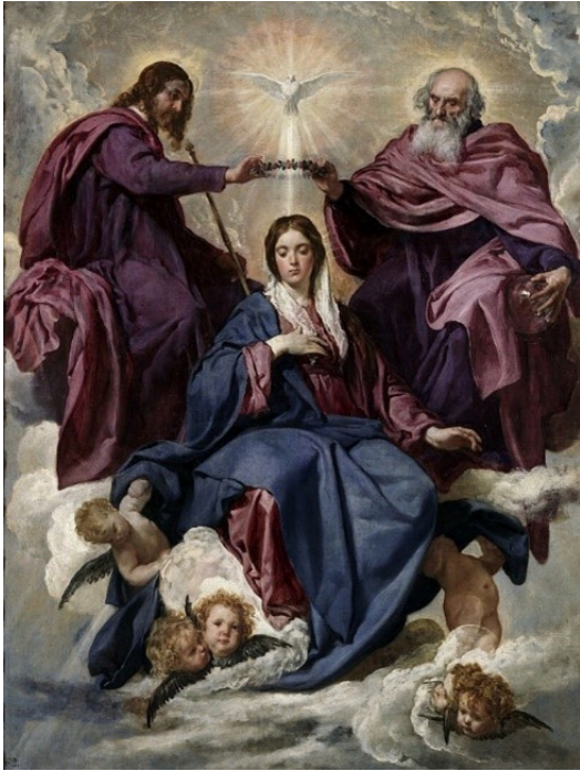
Diego Velázquez 1635–1636 Holy Trinity crowning the Blessed Virgin Mary.

"The moon was under her feet, and on her head a crown of twelve stars." Apoc. 12:1