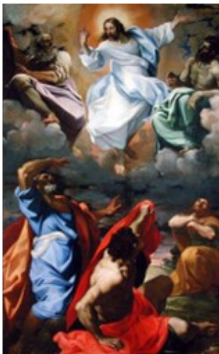
Lodovico Carracci, "The Transfiguration," 1594

Jesus took with him Peter and James and his brother John and led them up a high mountain, by themselves. And he was transfigured before them, and his face shone like the sun, and his clothes became bright as light. Suddenly there appeared to them Moses and Elijah, talking with him. (Matthew 17:1-3)