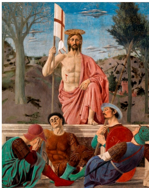
Piero della Francesca, 1463

... and the doors of the house where the disciples had met were locked for fear of the Jews, Jesus came and stood among them and said, "Peace be with you." (Jn. 20:19)