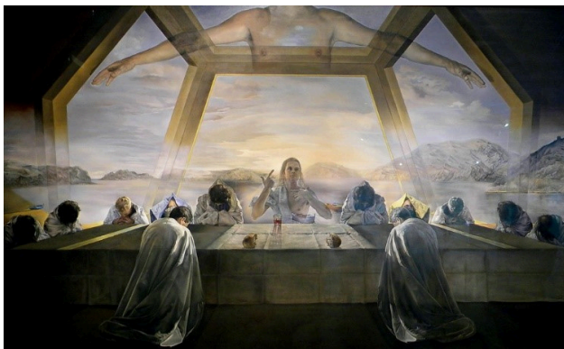
The Sacrament of the Last Supper, 1955 Salvador Dalí

While they were eating, Jesus took a loaf of bread, and after blessing it he broke it, gave it to the disciples, and said, "Take, eat; this is my body."